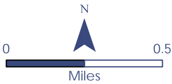
October 2022 VICINITY MAP Figure 1

Maxar Technologies Inc., 2020, Alaska High resolution imagery (5m). Available: https://gls.data.alaska.gov/pages/imagery%20Program .